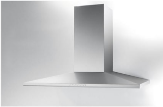
Hood Amélie 2447 090