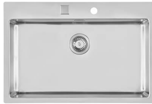
Sink KE Filotop 2266 050